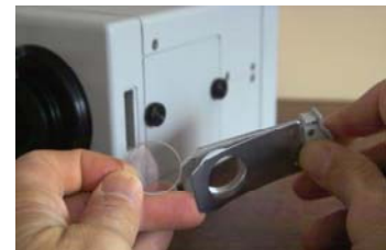
Filter drawer with holder. Install seldom or intermittent use filters here.

Some filters may be supplied with a protective plastic film covering the coating. BE SURE TO REMOVE THE FILM BEFORE USE!