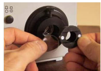
Bezel accepts filters too! Install IR and/or long term use filters here.