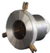
Connector for illuminator