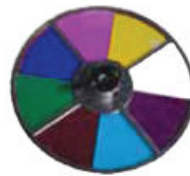
Color Wheel Option