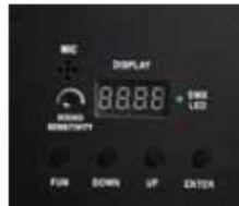
Detail of controller