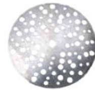
Twinkle Wheel Option