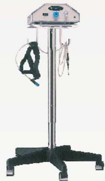
5 caster (2 lockable) stand.