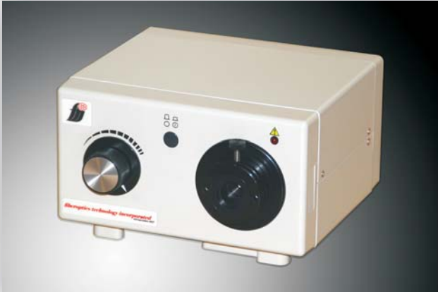
LO50 is the first LED light source more powerful than Halogen.